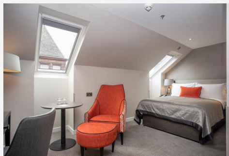
The Loft Room